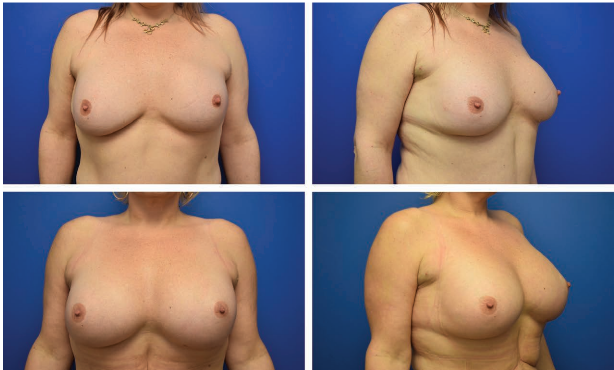
Fig. 3. Before and after photos of trans-female patient who presented for revision augmentation. The wider base width implant shown below provides superior cleavage and lateral fullness.

The masculine and feminine chest have distinct features that are commonly recognized: male chests are wider, have minimal breast tissue with little to no expansion of the skin envelope, smaller areolas, lateralized nipple-areola complex with less projection, a wider sternum, and greater pectoral muscle bulk. 4-6 The cis-female chest undergoes changes as a result of puberty, including breast tissue growth and other morphometric changes that do not resemble the cis-male chest. Although it is anecdotally understood that the trans-female chest resembles neither the cis female or cis male, the existing literature does not address the morphometric changes that result from the limited effects of exogenous estrogen. Furthermore, with the expansion of GCS in the United States, providers who may not routinely treat this patient population will be involved in their care, and it is important to understand how demographic differences and population factors unique to the trans community can impact the preoperative coun-