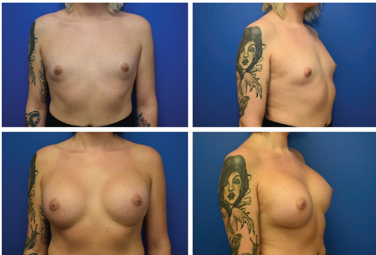
Fig. 6. Endomorph body type—685 mL SSM Allergan Natrelle silicone round implants in a subglandular pocket.

nia, San Francisco has recommended that screening should not start before the age of 50 years and after the patient at least have been on exogenous hormones for 5–10 years. 12