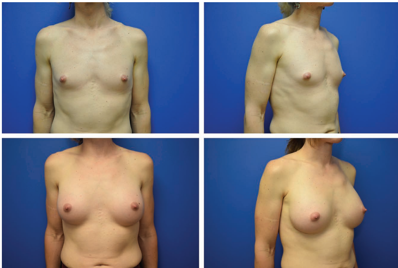
Fig. 4. Trans-female patient with ectomorph body type—395 mL Allergan Natrelle 410FM textured silicone shaped implants in a submuscular pocket. (Patient counseled on risk of breast implant–associated large cell lymphoma.)

Compromising on the BW will hinder the ability to create medial cleavage but—maybe more importantly—will