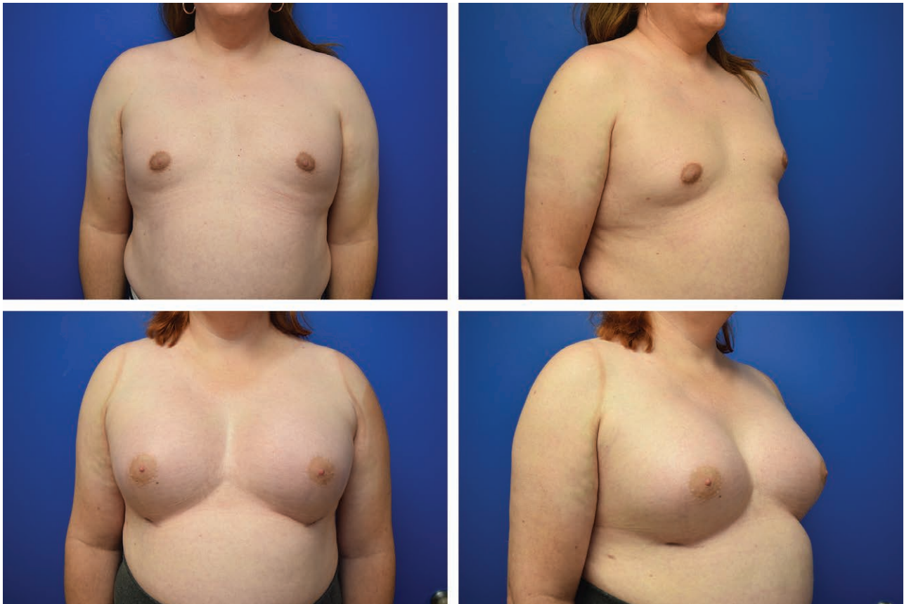
Fig. 5. Mesomorph body type—445 mL SSM Allergan Natrelle silicone round implants in a subglandular pocket (written permission given by patient to publish despite identifiers).

In the senior author's practice, the above data assist in deciding on an implant. Knowing the differences between populations allows for better communication with the patient and guidance in decision-making on 4 aspects of the breast augmentation consult: choice of implant, placement plane, incision site, and size. Estrogen starts to encourage breast growth and body fat redistribution within 3–6 months, with full effects in 2–3 years and 2–5 years, respectively. 12 It is, therefore, warranted to at least wait a year after beginning estrogen before performing augmentation. Further increase in volume may occur after augmentation. Although there are no commonly agreed on breast cancer screening guidelines for trans females, University of Califor-